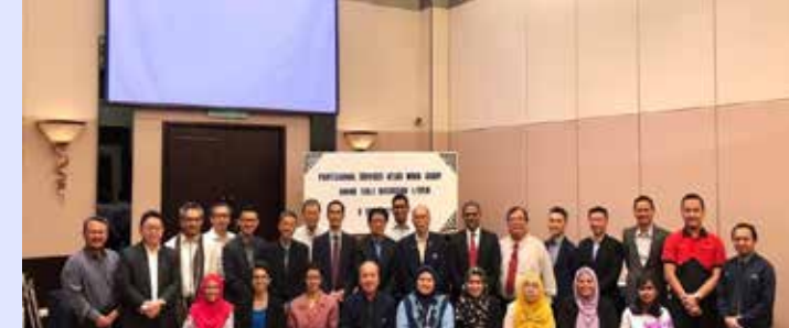
Professional Services Productivity Nexus Work Group RTD 1/2018