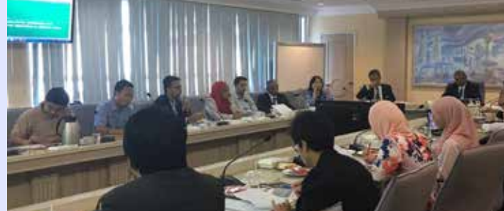
Private Healthcare Productivity Nexus Governing Committee Meeting 2/2018