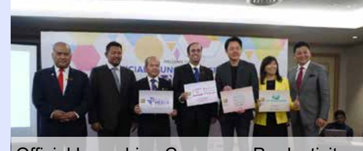
Official Launching Ceremony Productivity Nexus For Retail And F&B Flagship Program