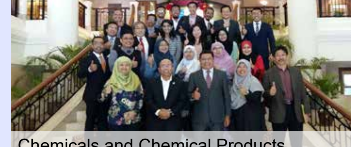
Chemicals and Chemical Products Productivity Nexus Governing Committee Meeting