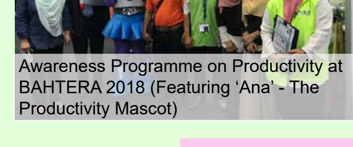
Awareness Programme on Productivity at BAHTERA 2018 (Featuring 'Ana' - The Productivity Mascot)