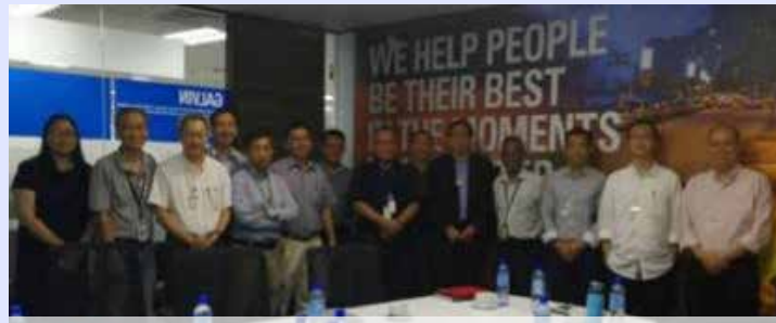
E&E Productivity Nexus Key Strategy 1 Enhance Higher Value-added Activities Meeting No. 2/2018