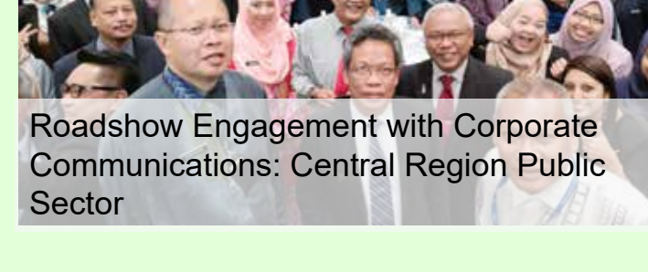
Roadshow Engagement with Corporate Communications: Central Region Public Sector