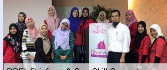
RPEL Briefings & Gap Skill Competency Analysis Productivity Nexus For Retail And F&B