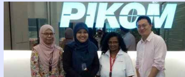
Discussion with PIKOM on Quick-Win projects for ICT Productivity Nexus