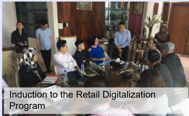
Induction to the Retail Digitalization Program