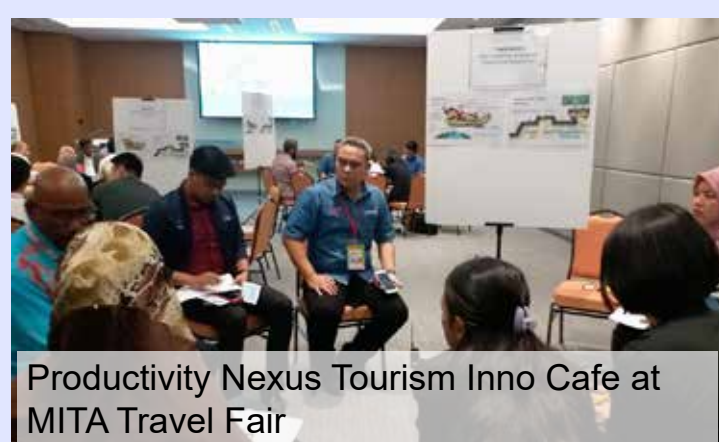
Productivity Nexus Tourism Inno Cafe at MITA Travel Fair