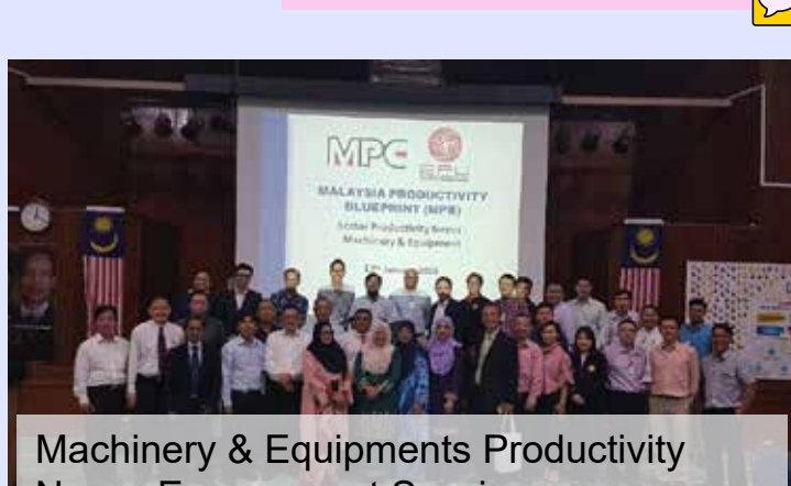
Machinery & Equipments Productivity Nexus Engagement Session