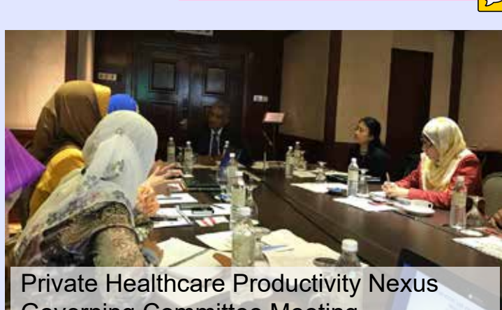
Private Healthcare Productivity Nexus Governing Committee Meeting