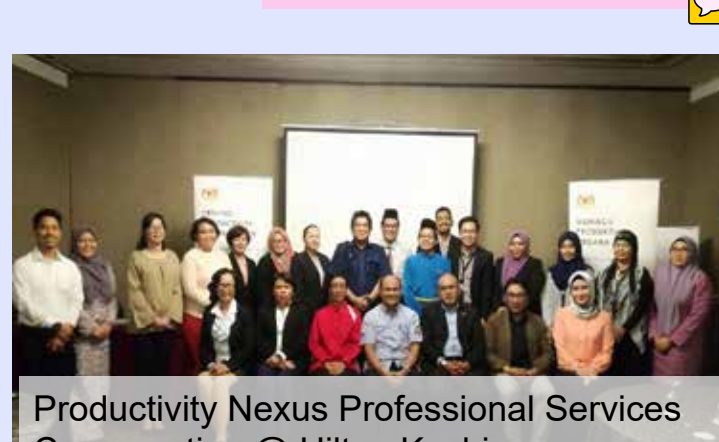
Productivity Nexus Professional Services Conversation @ Hilton Kuching