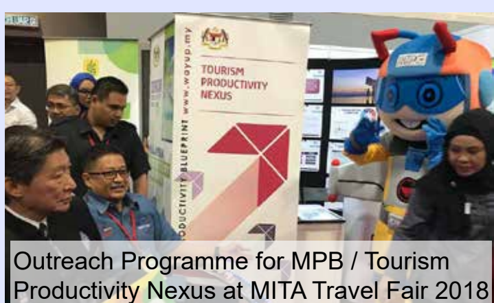
Outreach Programme for MPB / Tourism Productivity Nexus at MITA Travel Fair 2018