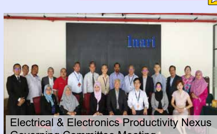
Electrical & Electronics Productivity Nexus Governing Committee Meeting