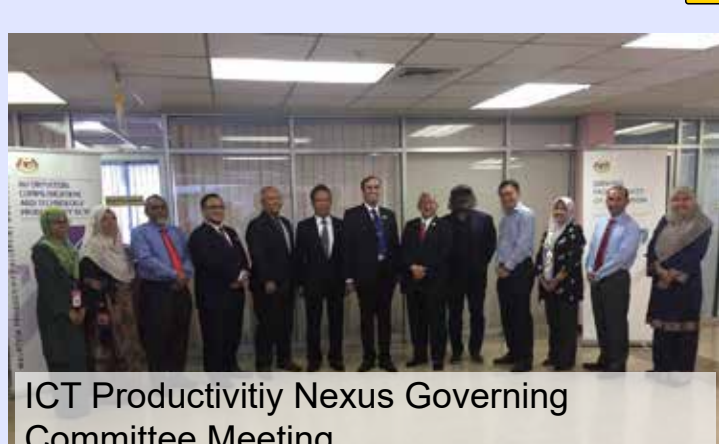
ICT Productivity Nexus Governing Committee Meeting